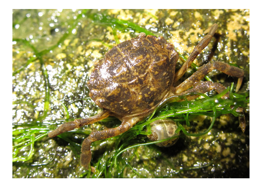
Fig. 1. Still photograph of the Harris mud crab in the study area.

in the diluted Baltic Sea and can form high-density populations (Maiju Lehtiniemi, pers. comm.); thus, it may exert strong pressure on the local benthic macrophyte and invertebrate communities. Despite its long invasion history, until very recently the distribution of R. harrisii was confined to Mecklenburg Bay, the Oder Estuary, the Gulf of Gdansk, and the Curonian Lagoon only (Jażdżewski & Konopacka, 1993; Bacevičius & Gasiūnaitė, 2008; Czerniejewski, 2009; Jażdżewski & Grabowski, 2011). Seemingly, R. harrisii has a large between population variability in Europe with more recent populations showing a tendency for increased genetic diversity (Projecto-Garcia et al., 2010). This suggests that R. harrisii is still in the process of expansion in Europe and its sudden northwards expansion seems to be a result of new introductions. In this study we report the sudden expansion of this alien invasive species over 500 km northwards and provide information on its distribution.