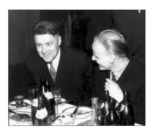
In Tallinn, 1960