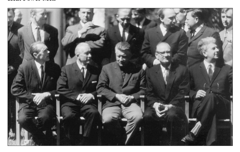
At Püssi, 1968