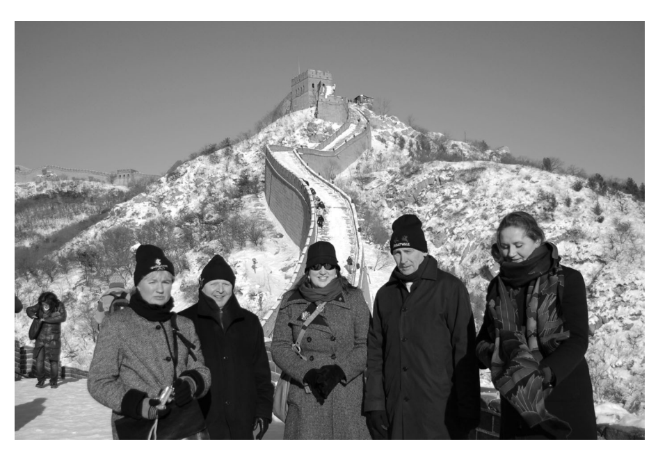
Delegation of Tallinn University of Technology on China's wall.

Chinese Government established Chinese Government Scholarship Programme (EU Window).